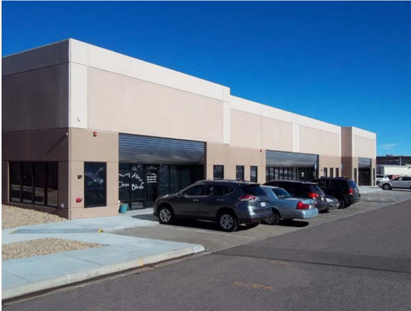
ALL photography, BOTH sides | Copyright © 2018 by J. Barry Winter | All Rights Reserved