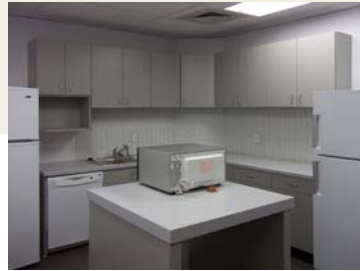
All photography both sides | Copyright © 2015 by J. Barry Winter | All Rights Reserved