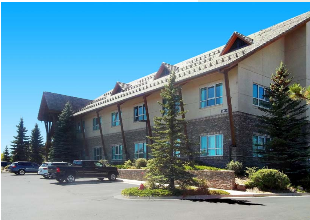
ALL photography, all pages | Copyright © 2018 by J. Barry Winter | All Rights Reserved

32135 Castle Court Evergreen, Colorado 80439