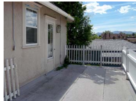
Second story deck