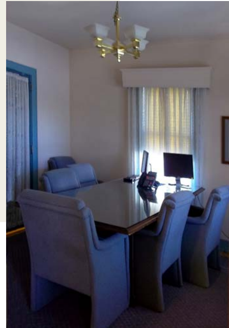
ALL photography, BOTH sides | Copyright © 2016 by J.Barry Winter | All Rights Reserved