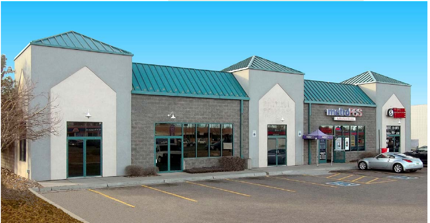
All Photography, both sides | Copyright © 2016 by J. Barry Winter | All Rights Reserved