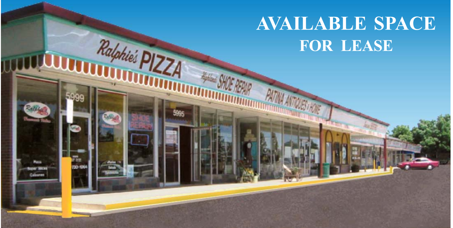
Photo-illustration | Copyright © 2008 by J. Barry Winter. All Rights Reserved