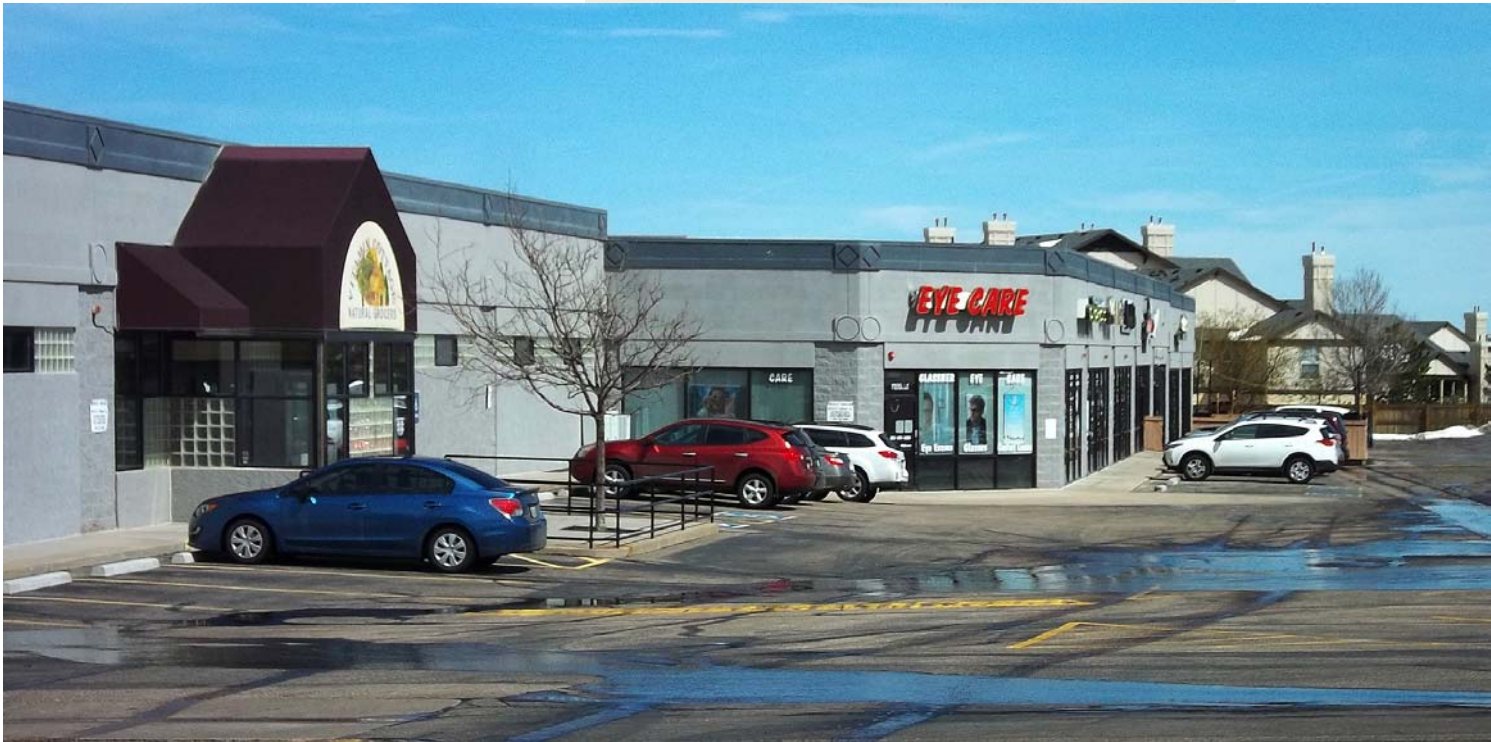
All photography, both sides | Copyright © 2016 by J. Barry Winter | All Rights Reserved

7456 South Simms Street, Littleton, Colorado